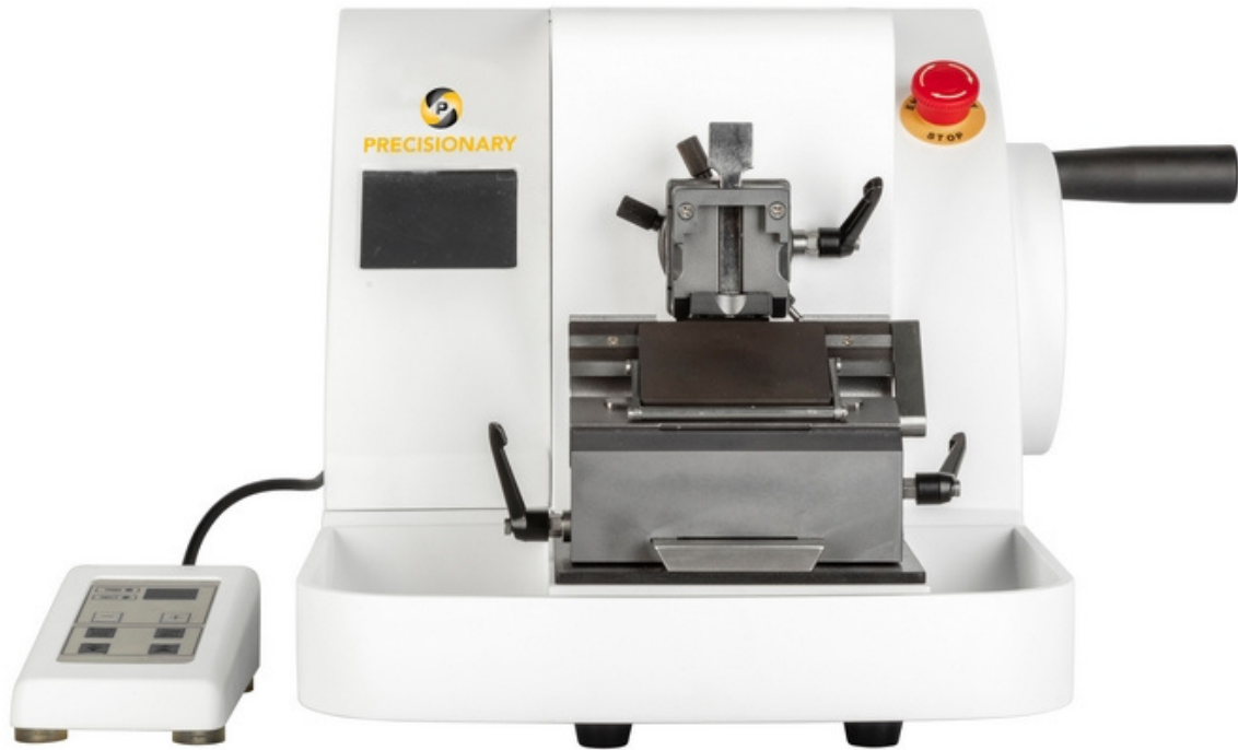
RF-1000 FULLY AUTOMATED